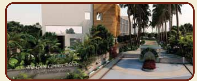
GRAN CARMEN VILLAS