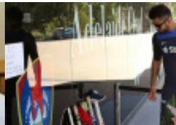
Kohli, Shastri, Fletcher to attend Hughes' funeral