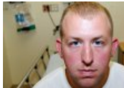
Ferguson shooting: Officer Wilson who killed black teen resigns from force