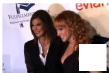
Celebrity News - 16/10/2014 2:23