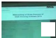
DRAW FOR DDA'S MEGA HOUSING... 0:32