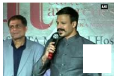
Vivek Oberoi organizes a fund raiser... 1:28