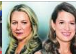
It's time literature dealt with the anti-heroine: Gillian Flynn and Cheryl Strayed