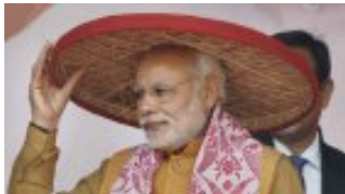
Indo-Bangla land swap deal will serve long-term security interests of the state: Modi