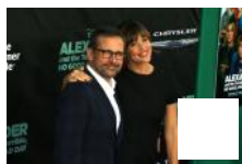
Celebrity News - 7/10/2014 1:35