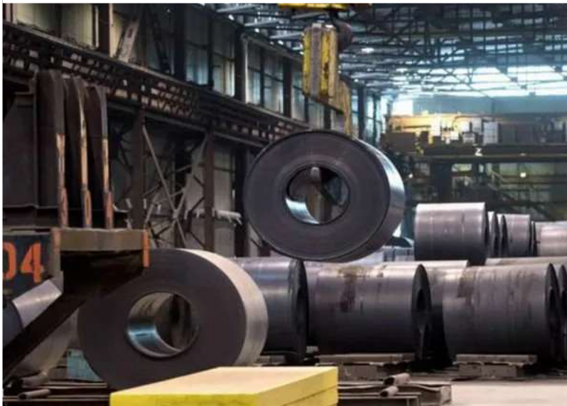
(Representational Image)

LME Copper prices have crossed the $9000/tn mark while LME Nickel moves beyond $20,000. Vaccine rollouts, optimism over economic recovery coupled with weak US$ has led to this advance.