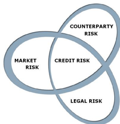
Figure 1: Key Risks in Securitisation