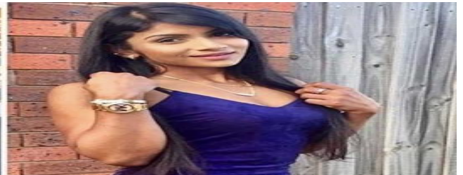
लड़की ने 20 किलो वजन कम करने के लिए इस फल का इस्तेमाल किया