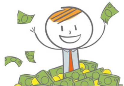
How tax slabs have changed over the years