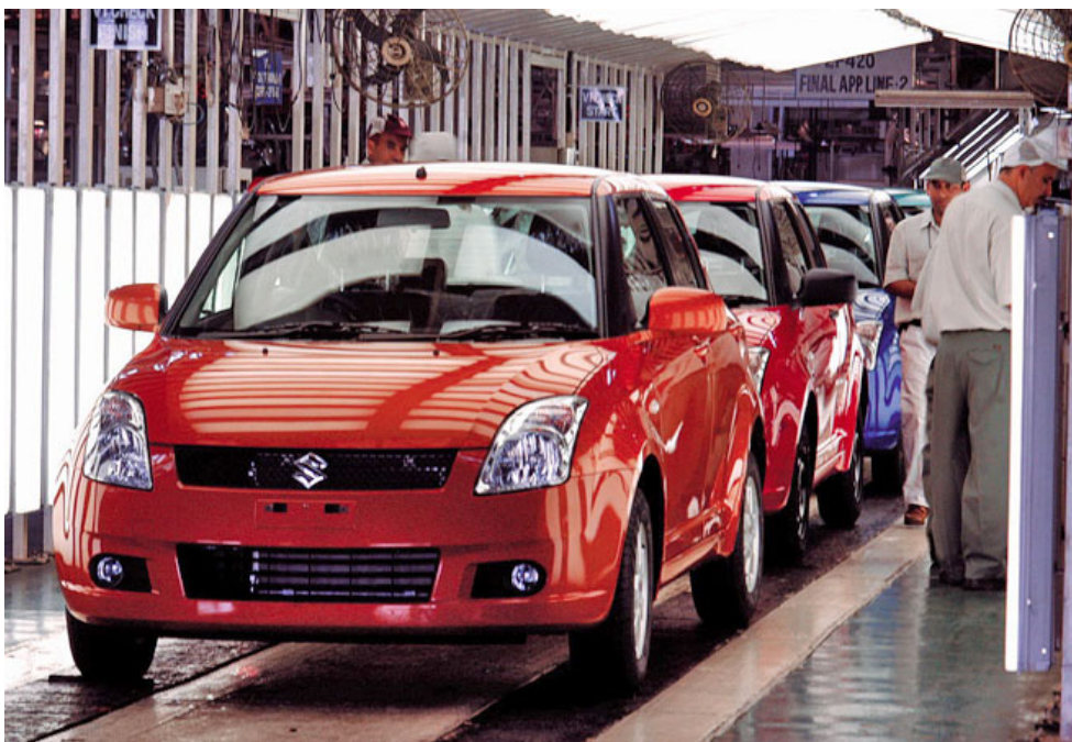
A Maruti Suzuki car assembly line is pictured here.

Last Updated: February 28, 2015 | 21:13 IST